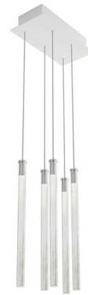
Shown in white / transparent

PRODUCT DIMENSIONS . . . . . Maximum Overall Height: 78 11/16" COLOR RENDERING . . . . . 80 CRI LAMP COLOR . . . . . 2700K LUMENS/WATT . . . . . 476.19 LUMINOUS FLUX . . . . . 1000 lumens