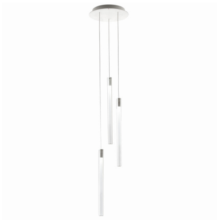
Shown in white / transparent