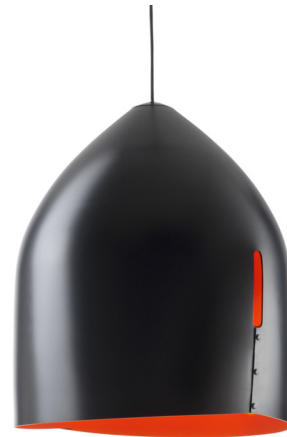
Shown in black / black / red

The Oru Pendant is an original interpretation of metal. Metal shades are generally symmetric, but Oru is not. The distinctive side cut-out allows the shade to be bent and fixed in its new form. The result is a lampshade that appears to have a typical symmetrical shape when seen from an angle, but when viewed from another, the hole and slim organic shape can be noticed. The designers wanted to pay tribute to the art of metal bending and produced a lampshade design that celebrates the artisan trade with automatic scalability for the switch to mass production.