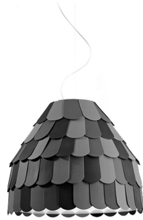
Shown in white / anthracite

The Roofer A01 High Pendant draws its inspiration from roof tiles and makes the shingle the central element. The shingles are made of semi-rigid rubbery material with a scalloped appearance to mimic roof tiles and connected to a hidden rigid structure. The lower part is closed with a polymethyl-methacrylate diffuser disk.