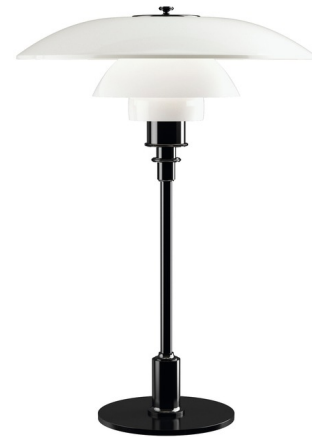
Shown in black / white opal

Ph 3 1/2 2 1/2 Glass Table Lamp, designed by Poul Henningsen, is based on the principle of a reflective three-shade system, which directs the majority of the light downwards. The shades are made of hand blown opal three-layer glass, which is glossy on top and sandblasted matte on the underside, giving a soft and diffuse light distribution. In-line on/off switch on cord.