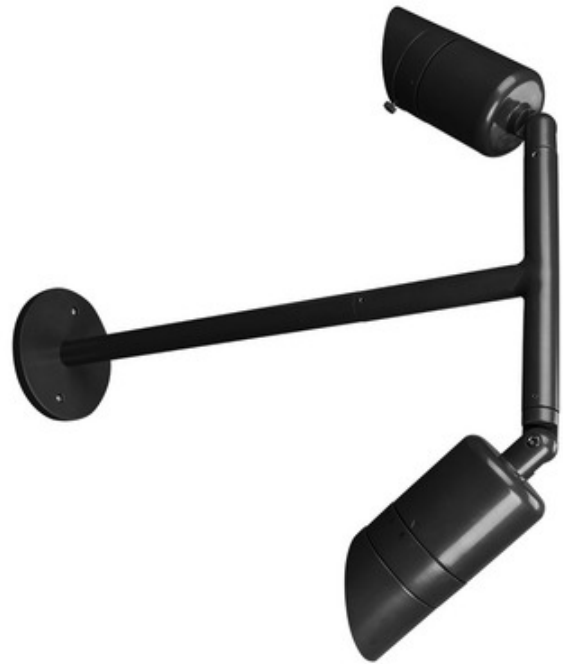
Shown in: Architectural Black

The Endurance Double Signage Light is made of die-cast aluminum with an Architectural Black, Bronze, Graphite or Bronze finish. Rotate head to adjust the beam angle indexed at 15, 25, 40, and 60 degrees. Includes detachable shroud, canopy, extension rod kit, and safety cable. Safety cable recommended for extensions over 36 inches. One 6 inch, one 12 inch, and one 24 inch interchangeable downrod included for a maximum 48 inch extension. Two 15 watt 120 volt adjustable beam LED modules are included. Choice of 3000K or 4000K color temperature. Operates from -40 to 122 degrees Fahrenheit. ETL listed for wet locations. IP66 rated.