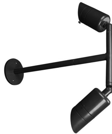
Shown in architectural black

LAMP LIFE . . . . . 50000 hours BEAM SPREAD . . . . . Adjustable COLOR RENDERING . . . . . 85 CRI LAMP COLOR . . . . . 3000K LUMENS/WATT . . . . . 152.00 LUMINOUS FLUX . . . . . 2280 lumens