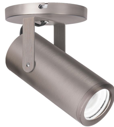
Shown in brushed nickel

LAMP LIFE . . . . . 60000 hours BEAM SPREAD . . . . . Adjustable COLOR RENDERING . . . . . 90 CRI LAMP COLOR . . . . . 3000K LUMENS/WATT . . . . . 46.00 LUMINOUS FLUX . . . . . 920 lumens