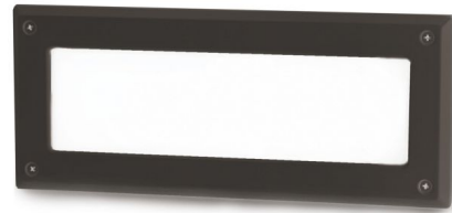
Shown in architectural bronze / opal

The Endurance Brick Light is constructed of die-cast aluminum with an Architectural Bronze, Black, White, or Graphite finish and Opal tempered glass for even illumination. Easily retrofits most existing incandescent brick light installations. Integrated 5.5 watt 120 volt factory-sealed LED light engine. 9.5 inch width x 4 inch height. ETL listed for wet locations. IP66 rated.