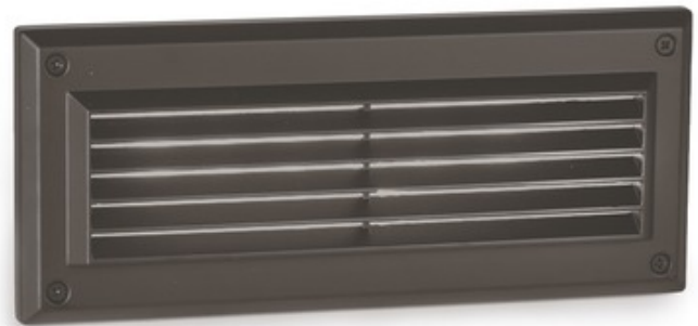
Shown in: Architectural Bronze

The Endurance Louvered Brick Light is constructed of die-cast aluminum with an Architectural Bronze, Black, White, or Graphite finish. Easily retrofits most existing incandescent brick light installations. Integrated 5.5 watt 120 volt factory-sealed LED light engine. 9.5 inch width x 4 inch height. ETL listed for wet locations. IP66 rated.