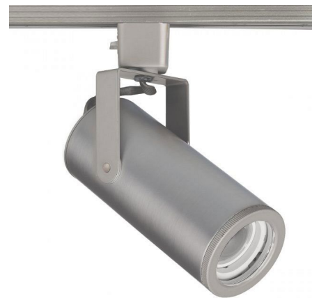
Shown in brushed nickel

LAMP LIFE 60000 hours BEAM SPREAD Adjustable COLOR RENDERING 90 CRI LAMP COLOR 3000K LUMENS/WATT 46.00 LUMINOUS FLUX 920 lumens