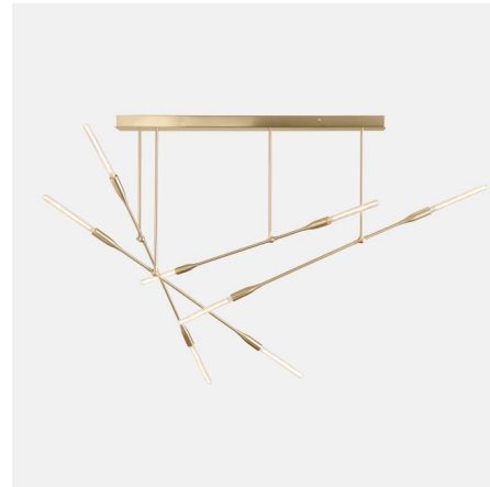
Shown in brushed brass / brass details

Sorenthia Quad Chandelier is as distinctive as it is dynamic. Make a statement by configuring the slender, adjustable arms to your liking in this awe-inspiring piece. Hangs from a rectangle canopy..