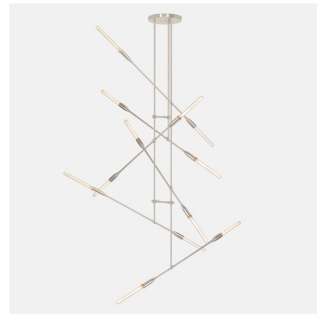
Shown in brushed nickel / nickel details

Sorenthia Grand Chandelier is as distinctive as it is dynamic. Make a statement by configuring the slender, adjustable arms to your liking in this awe-inspiring piece.