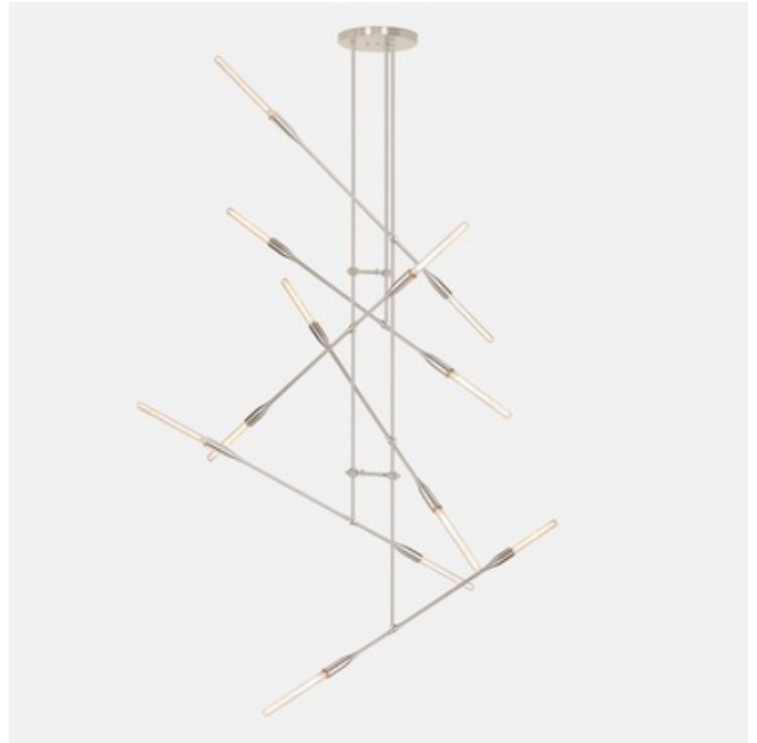
Shown in: Brushed Nickel / Nickel Details

Sorenthia Grand Chandelier is as distinctive as it is dynamic. Make a statement by configuring the slender, adjustable arms to your liking in this awe-inspiring piece.