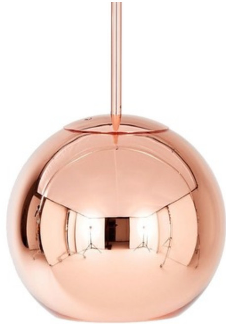
Shown in: Copper

Copper Round Pendant designed by Tom Dixon, features a highly reflective shade finished in Copper, Blue, or Black. Created by exploding a thin layer of pure metal onto the internal surface of a polycarbonate globe. Available in two sizes. UL and CUL listed. Designed in London.