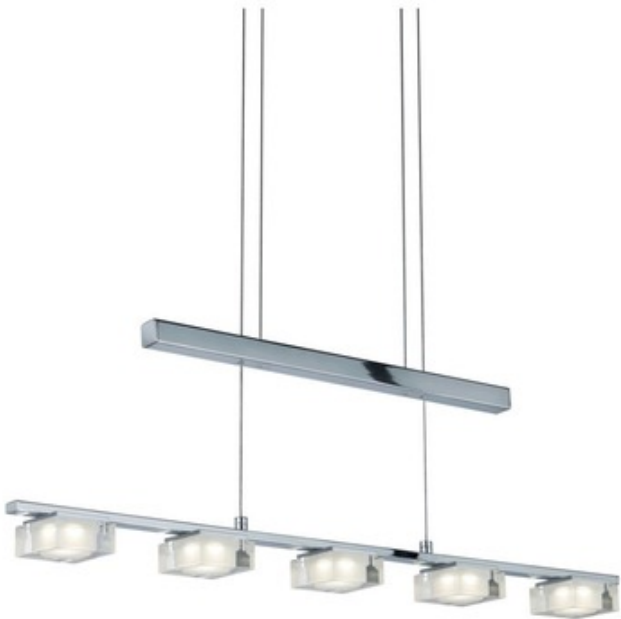
Shown in: Chrome / Clear

The Brooklyn Linear Pendant t is an excellent choice for those who love contemporary minimalist style. Features orbs of Satin glass that are nestled within cubes of Clear glass and paired with a Chrome frame. Includes Quattro dimming, which means no dimmer switch is required. You can choose from four different levels of light with just the flick of a light switch. Fixture has a counter weight for height adjustment. ETL listed.