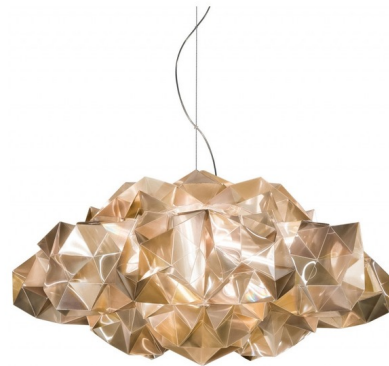
Shown in white / velvet

Drusa Pendant draws inspiration from crystals poking out from crevices in the rocks; they exhibit an ever-changing, poetic and multiform kaleidoscope when hit by the light. The contemporary, chromatic angles accentuated by Lentiflex finished with a Silky print, are muted by the central light source, that not only gives depth to the design, but creates harmony between light and shape. Includes Slamp Magnetic hanging system.