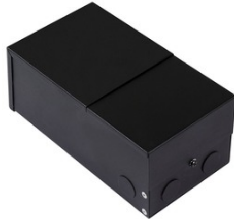
Shown in: Black

300 Watt 12 Volt 2-Circuit (2X150W) Outdoor Remote Magnetic Transformer converts line voltage 120V input to low voltage 12 volt output. Minimum load: 50 watts. The remote transformer must be installed in an accessible remote location. To avoid overheating the power supply, install it in a ventilated remote location where air flows. Maintain proper spacing among power supplies when multiple power supplies are installed in the same remote location. Dimmable using a magnetic low voltage dimmer, sold separately.