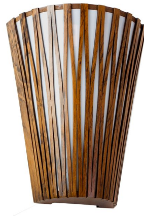
Shown in imbuia / white acrylic

The Living Hinges Wall Sconce blends clean lines with a touch of outdoor charm, perfect for elevating your interior space. The natural veneer shade is complemented by an acrylic diffuser that casts soft, warm light and gentle shadows throughout your room.