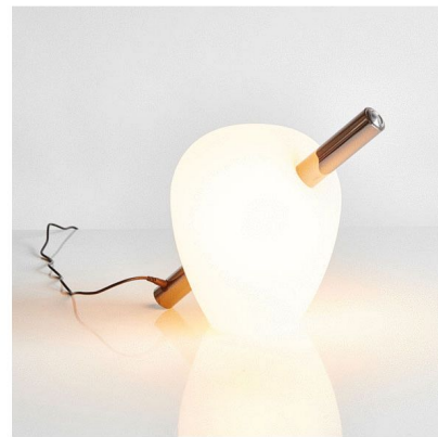
Shown in black chrome

The Pierced Light features a blown glass body as a diffuser and a steel rod with internal LED light source. Molten glass is rolled and inflated and then pierced on an angle before it solidifies. The lamp is finished in Black Chrome and is activated by a button at the end of the rod. One 5 watt 120 volt LED module is included. 12 inch width x 11 inch height x 8 inch depth.