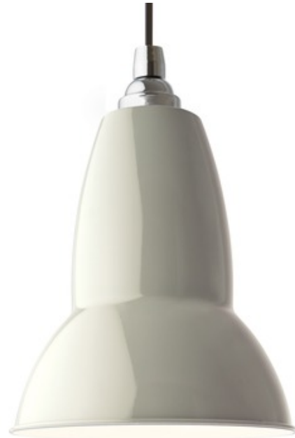
Shown in: Linen White

The Original 1227 Pendant with the traditional Anglepoise shape shade, creates a striking visual feature alone or matched with others to create a bold presence in your space. Available in Linen White or Jet Black with Chrome fittings. Canopy: 5.75 inch diameter. UL listed.