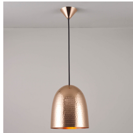
Shown in hammered copper

The Stanley Pendant is hand spun in Birmingham, UK and perfect where you want an industrial vibe. Available in Small, Medium, and Large. Mix sizes, metals, and textures for a totally custom look.