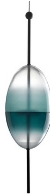
Shown in: Black / Turquoise Gradient

The Flow S1 Pendant, designed by Nao Tamura, is inspired by the reflections of the Venetian cityscape glistening on the evening water that hints at an imaginary city below the moving surface. There is a border between the world under and the land above. In the city of Venice, where the real world and fantasy coexists, this pendant is the embodiment of the beauty of dual worlds. Available in hand blown gradient Turquoise or White glass with a flush mount disc or standard canopy in Black with a black stem. Includes a 4 watt 24VDC driver which fits inside canopy/ junction box.