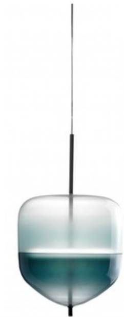
Shown in: Black / Turquoise Gradient

The Flow S4 Pendant, designed by Nao Tamura, is inspired by the reflections of the Venetian cityscape glistening on the evening water that hints at an imaginary city below the moving surface. There is a border between the world under and the land above. In the city of Venice, where the real world and fantasy coexists, this pendant is the embodiment of the beauty of dual worlds. Available in hand blown gradient Turquoise or White glass with a Black stem.