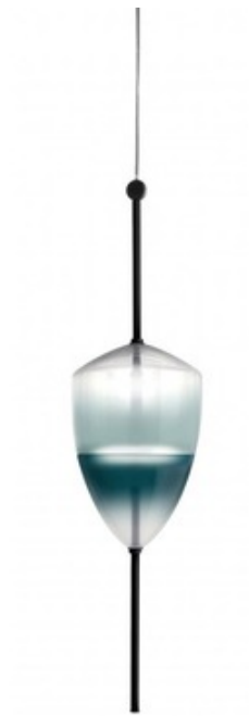
Shown in: Black / Turquoise Gradient

The Flow S6 Pendant, designed by Nao Tamura, is inspired by the reflections of the Venetian cityscape glistening on the evening water that hints at an imaginary city below the moving surface. There is a border between the world under and the land above. In the city of Venice, where the real world and fantasy coexists, this pendant is the embodiment of the beauty of dual worlds. Available in hand blown gradient Turquoise or White glass with a flush mount disc or standard canopy in Black with a black stem. Includes a 4 watt 24VDC driver which fits inside canopy/ junction box.