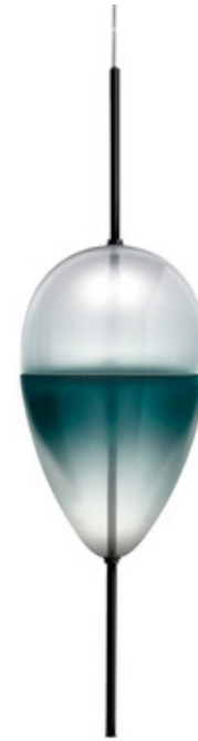
Shown in: Black / Turquoise Gradient

The Flow S7 Pendant, designed by Nao Tamura, is inspired by the reflections of the Venetian cityscape glistening on the evening water that hints at an imaginary city below the moving surface. There is a border between the world under and the land above. In the city of Venice, where the real world and fantasy coexists, this pendant is the embodiment of the beauty of dual worlds. Note: Please select flush disc canopy or standard canopy. Includes 5W 24VDC driver which fits inside canopy/junction box