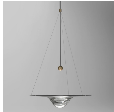
Shown in brass / crystal transparent

PRODUCT DIMENSIONS . . . . . Max Overall Height: 157" LAMP COLOR . . . . . 3000K LUMENS/WATT . . . . . 150.00 LUMINOUS FLUX . . . . . 450 lumens