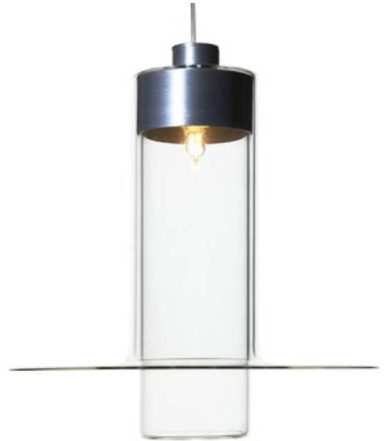
Shown in: Nickel / Clear

Sleeve Pendant, designed by John Pawson, sets one hand-blown glass cylinder within another, the outer cylinder flaring into a refined disc lip at its lower edge. The lamp casts light downwards, but its clear body also glows along its entire length.