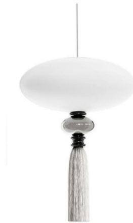
Shown in frost white / smoky grey

PRODUCT DIMENSIONS . . . . . Cord Length: 156" LUMENS/WATT . . . . . 100.00 LUMINOUS FLUX . . . . . 800 lumens