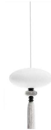
Shown in frost white / smoky grey

PRODUCT DIMENSIONS . . . . . Cord Length: 156" LUMENS/WATT . . . . . 100.00 LUMINOUS FLUX . . . . . 800 lumens