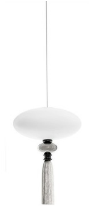
Shown in: Frost White / Smoky Grey

Calliope N2 Pendant is inspired by Japanese calligraphy and created from hand blown Murano glass. The floating, illuminating pendants have an adaptable design that can expand to create full ceiling and room installations as either clusters or as a single element. From overhead, it captures attention as it inspires the imagination. Marrying an element of ancient Asian culture with free moving parts has resulted in a product that embodies both classic and contemporary design. Crystal and Smoky Grey combination includes a white tassel. All other options include a black tassel.