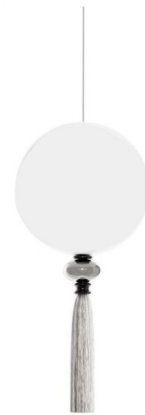
Shown in frost white / smoky grey

PRODUCT DIMENSIONS . . . . . Cord Length: 156" LUMENS/WATT . . . . . 100.00 LUMINOUS FLUX . . . . . 800 lumens