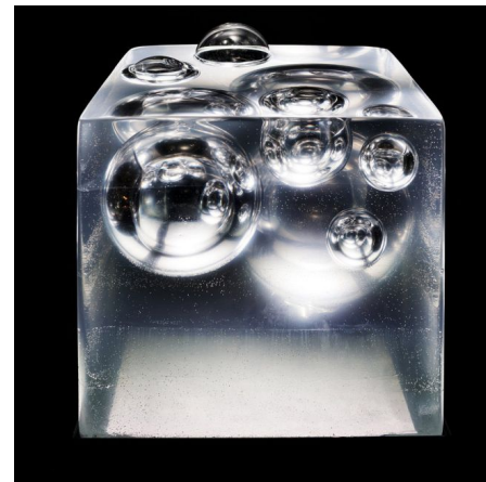
Shown in crystal

Rise Element, designed by Hideki Yoshimoto, focuses on the organic shapes of water bubbles and the refraction of light. Supported by WonderLab, the laboratory of innovation and technology at WonderGlass, Yoshimoto challenged the complex way light transmits and reflects inside different materials, resulting in a mesmerizing visual effect. Yoshimoto's work seeks to capture a dynamic moment in time and is reminiscent of air rising through the water, suggesting the possibilities of life below - a presence that we cannot see but are inspired to imagine. Available in Crystal. 13.77 inch width x 13.77 inch height.