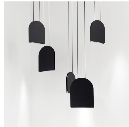
Shown in black

Thin Pendant, designed by Alain Berteau, can be described as a flattened re-imagining of traditional lamp typologies. Their innovative layered design allows perfect cooling of the powerful LED's components while the archetypal silhouettes offer a very distinctive yet familiar presence. Scalable and versatile, suitable for both residential and public use. Available in Black or White in small and large sizes. One 13 watt 120 volt LED module is included. Includes canopy to cover US junction box. ETL listed. Dimmable with a leading/trailing edge dimmer, sold separately.