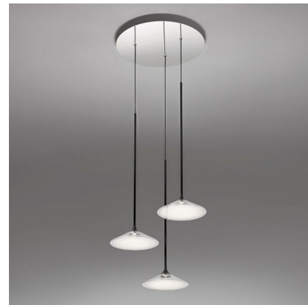
Shown in black / clear