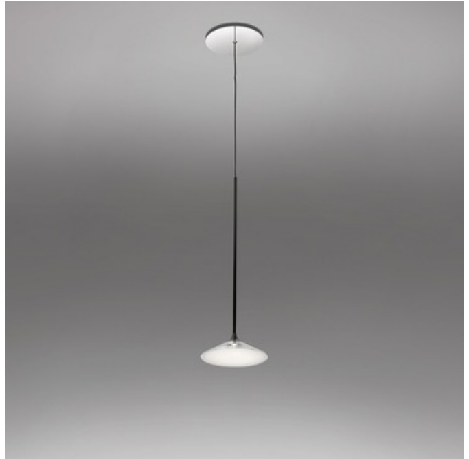
Shown in: Black / Clear

The Orsa Pendant is the embodiment of precision. An elegant pendant pared down to its essential elements, Orsa allows the light to express a larger volume. A slim metal stem flares out at one end to form the heat-sink and housing for the LED, with a UV bonded glass cover containing the light source. The design of the glass cover ensures that the light source remains invisible, making the pendant appear like a floating disk of light. The glass takes its shape from the focused output of the LED, which is diffused through a specially engineered etched lens that allows the light to focus over a wider area. Two sizes available.