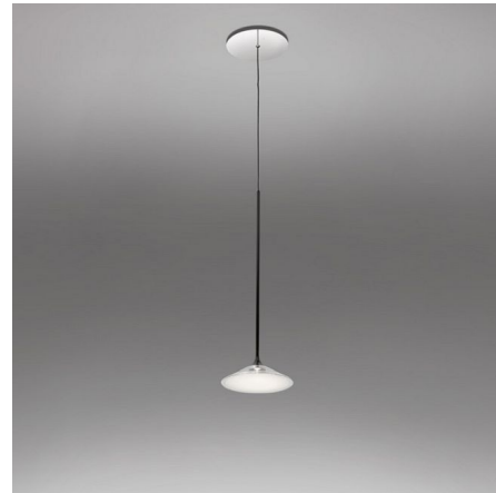
Shown in black / clear

LAMP LIFE . . . . . 50000 hours COLOR RENDERING . . . . . 90 CRI LAMP COLOR . . . . . 3000K LUMENS/WATT . . . . . 53.41 LUMINOUS FLUX . . . . . 454 lumens