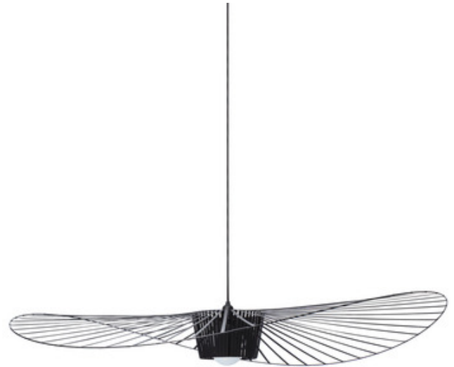
Shown in: Black / Black

The Vertigo Pendant is simultaneously ethereal and graphic, adapting to both large and small spaces where it creates it's own intimate space. With its ultra light fiberglass structure, stretched with velvety polyurethane ribbons, this pendant lamp fascinates as it comes to life swaying in the soft air currents that surround it.