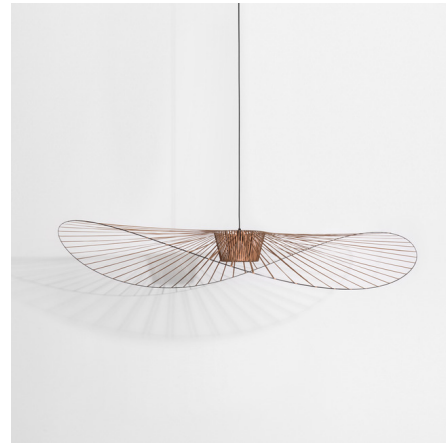
Shown in black / copper

The Vertigo Pendant is simultaneously ethereal and graphic, adapting to both large and small spaces where it creates its own intimate space. With its ultra light fiberglass structure, stretched with velvety polyurethane ribbons, this pendant lamp fascinates as it comes to life swaying in the soft air currents that surround it.