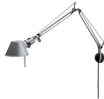
Shown in aluminum

COLOR N/A BODY FINISH Aluminum WATTAGE 100W DIMMER N/A DIMENSIONS 51.6"L x 5.9"W x 26.4"H x 31.9"D BULB NOT INCLUDED 1 x A19/Medium (E26)/100W/120V Incandescent COUNTRY OF ORIGIN Italy