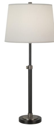
Shown in lead bronze / fondine

COLOR . . . . . Fondine BODY FINISH . . . . . Lead Bronze WATTAGE . . . . . 150W DIMMER . . . . . Included DIMENSIONS . . . . . 13"W x 32"H BULB NOT INCLUDED . . . . . 1 x A19 3-Way/Medium (E26)/150W/120V Incandescent COUNTRY OF ORIGIN . . . . . China