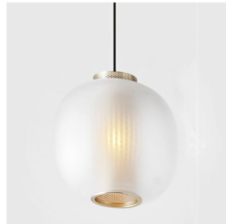
Shown in nickel / white

The Bloom Pendant is inspired by the gentle dynamic flow of paper lanterns, resulting in transparency and light. Two contrasting materials, a finely perforated mesh core and frosted blown glass, combine to project a soft focus texture onto the inside of the shade. At the same time, an unobstructed pool of light is projected downwards onto objects below. Bloom's distinct character is evident both in its on and off state, creating a versatile piece. Available with a White or Textured Black shade and a Black cord in two sizes. 4.17 inch diameter canopy in Black finish. UL and CE listed.