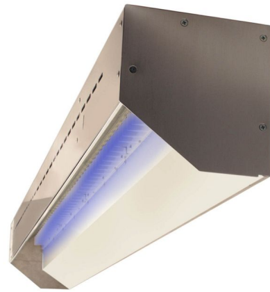
Shown in aluminum

The Stratus Linear Indoor RGB Wall Grazer is a Non-IC rated fixture designed for use in recessed cove or surface mount applications for new residential, new commercial and remodel. Lights textured walls up to 30 feet high. Available in 1 foot and 4 foot lengths in RGB (Red-Blue-Green) with field replaceable LED. Link multiple Stratus fixtures to create long runs. Included components: Wall mounting bracket, housing, joiner bracket, reflector, LED panel, one internal DMX power supply, and louver. Note: End caps and controller sold separately. Feed fixture with 120-277VAC. For indoor dry locations. Product is built to order.