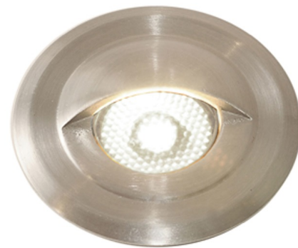
Shown in stainless steel