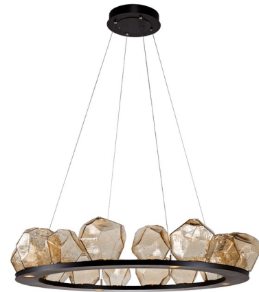
Shown in matte black / amber

PRODUCT DIMENSIONS . . . . . Max Overall Length: 145" COLOR RENDERING . . . . . 93 CRI LAMP COLOR . . . . . 2700K LUMENS/WATT . . . . . 1,578.57 LUMINOUS FLUX . . . . . 3315 lumens