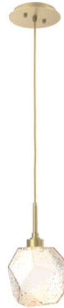
Shown in: Gilded Brass / Amber

The Gem Pendant is jewelry for your home. Features a gem of LED lit hand blown glass that are meticulously crafted by Hammerton artisans. The fixture gives a nod to an organic aesthetic that exudes casual sophistication. Each shade takes the place of a traditional bulb and unfolds with striking illumination. The finished look is relaxed, soft and unique. Each glass shade is a one-of-a-kind artisan creation.