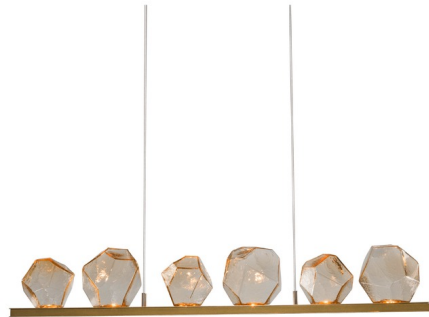
Shown in gilded brass / amber

The Gem Bezel Linear Pendant is jewelry for your home. Features gems of LED lit hand blown glass that are meticulously crafted by Hammerton artisans. The fixture gives a nod to an organic aesthetic that exudes casual sophistication. Each shade takes the place of a traditional bulb and unfolds with striking illumination. The finished look is relaxed, soft and unique. Each glass shade is a one-of-a-kind artisan creation.