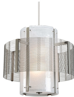
Shown in beige silver / frosted granite

The Downtown Mesh Double Drum Pendant features an inner Frosted Granite glass diffuser with a finely woven mesh drum shade in Flat Bronze, Metallic Beige Silver, Matte Black, or Gilded Brass with matching cord and canopy. Available in two sizes. Made in the USA. UL listed.