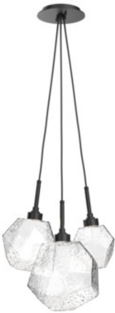
Shown in: Matte Black / Clear

The Gem Cluster Pendant is jewelry for your home. Features gems of LED lit hand blown glass that are meticulously crafted by Hammerton artisans. The fixture gives a nod to an organic aesthetic that exudes casual sophistication. Each shade takes the place of a traditional bulb and unfolds with striking illumination. The finished look is relaxed, soft and unique. Each glass shade is a one of a kind artisan creation. Available in 3 or 6 light options.