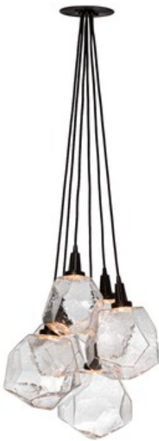
Shown in: Matte Black / Clear

The Gem Cluster Pendant is jewelry for your home. Features gems of LED lit hand blown glass that are meticulously crafted by Hammerton artisans. The fixture gives a nod to an organic aesthetic that exudes casual sophistication. Each shade takes the place of a traditional bulb and unfolds with striking illumination. The finished look is relaxed, soft and unique. Each glass shade is a one of a kind artisan creation. Available in 3 or 6 light options.