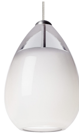
Shown in satin nickel / white

The Alina Freejack Pendant features a hand-blown Venetian teardrop shaped glass shade with beautiful clear draw. Compatible for use with 1-circuit Monorail track system or Freejack canopy. Supplied with six feet of field-cutttable suspension cable and a Freejack connector. Freejack canopy required if used as a monopoint, sold separately.