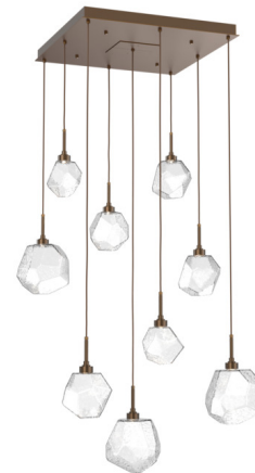
Shown in flat bronze / clear

PRODUCT DIMENSIONS . . . . . Adjustable Cable Lengths: 120" COLOR RENDERING . . . . . 93 CRI LUMENS/WATT . . . . . 592.31 LUMINOUS FLUX . . . . . 3080 lumens