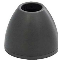
Shown in antique bronze

Tinkerbell metal shade with integral louver lens holder is available in Antique Bronze or Satin Nickel finish. Can hold up to two lenses or louvers, sold separately. Antique Bronze, MR16 of up to 35 watts. Satin Nickel MR16 of up to 50 watts. Available for use on Freejack Aero, Helios, Tilt and Torpedo Pendant, sold separately ETL listed. 2.5 inch diameter x 1.8 inch height.